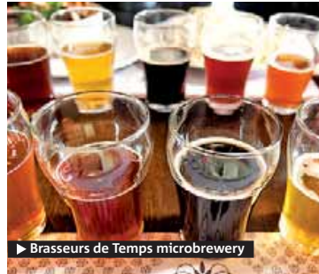
► Brasseurs de Temps microbrewery