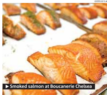
► Smoked salmon at Boucanerie Chelsea